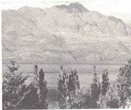
Beautiful New Zealand Countryside

We take this opportunity to say "WELCOME!" to you who were baptised, and are busy qualifying to help rule this world righteously!